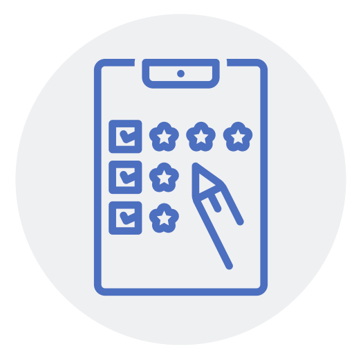
Applying to College