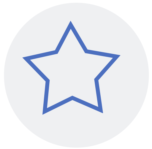
Scholarhips & Financial Aid